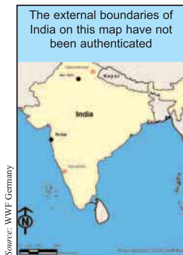
Location of the project sites in India (see asterisks)