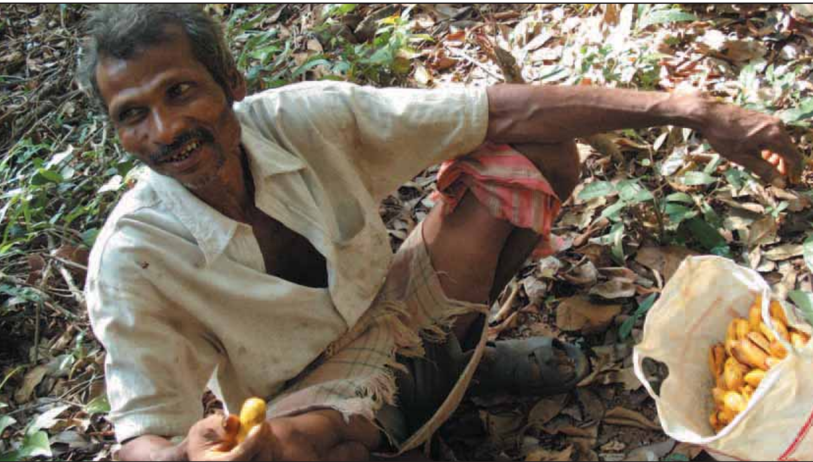
Community worker with the project in Karnataka, India.