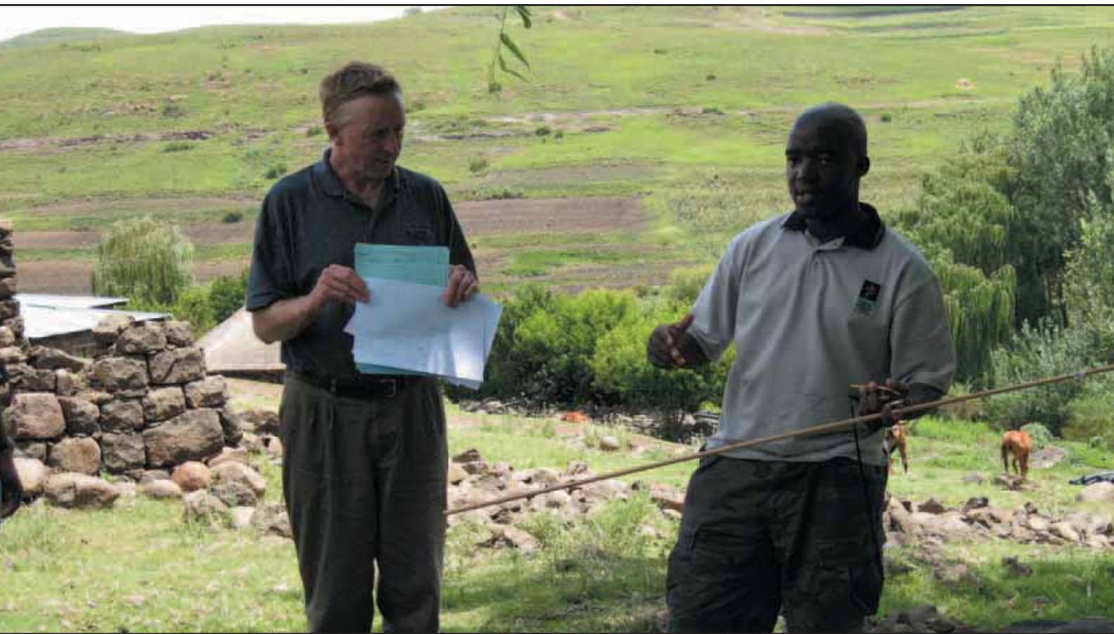
Project workers in the field in Lesotho.