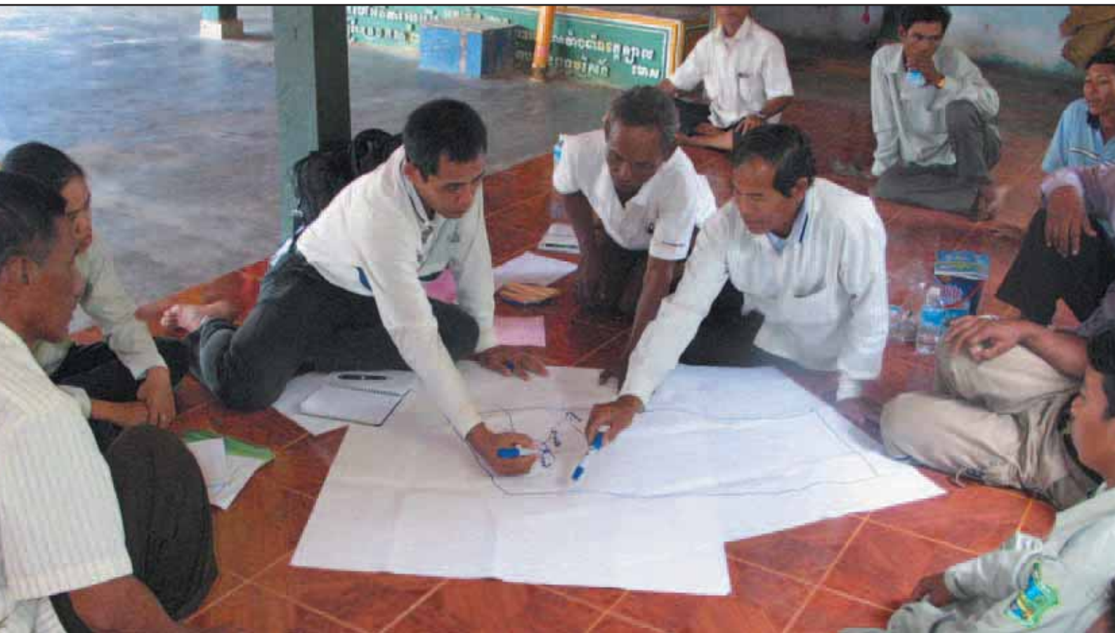
Project workers in action in Cambodia.