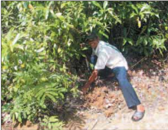
Harvesting on site in Cambodia

harvesting. A second important lesson was that market analysis and the establishment of trade links were crucial to give a long-term perspective to the collectors and their families, so that they could increase their livelihoods by better resource management in combination with more reliable market access.