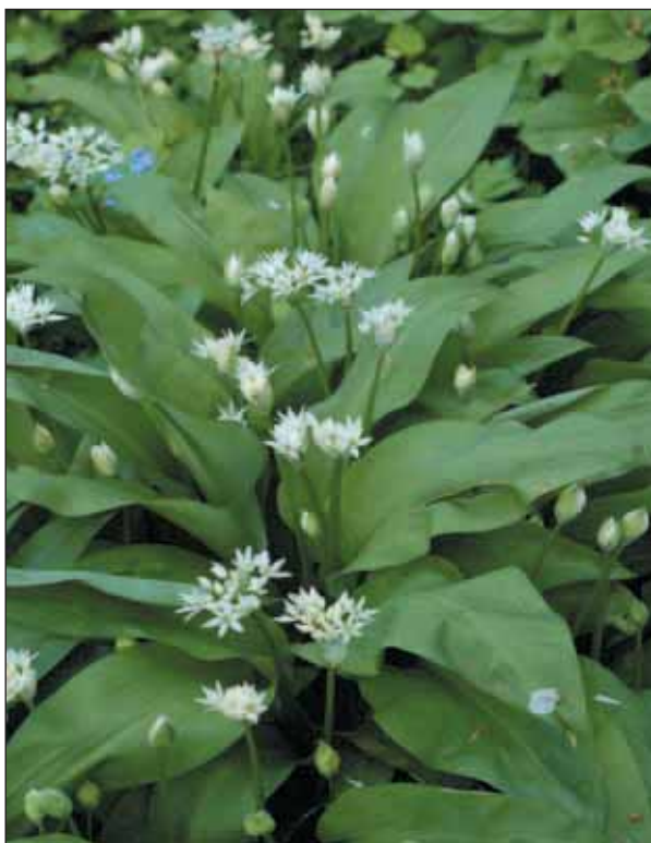
Wild Garlic Allium ursinum

Triggered through awareness-raising activities at international level, as a spin-off success of this project, perhaps one of the most advanced applications of ISSC-MAP to State regulations has been with regard to CITES-listed African Cherry Prunus africana in Cameroon . In 2008, after the initial development of regional FAO guidelines on the issuance of permits for NTFP collection (based on ISSC-MAP guidelines (FAO et al. , 2008)), a CITES workshop on P. africana identified ISSC-MAP as a suitable tool for identifying priorities for action in the development of a national management plan for P. africana for Cameroon (Ingram et al. , 2009). It is hoped that eventual application of ISSC-MAP will provide Cameroon with the means to re-establish trade in P. africana based on sustainable grounds.