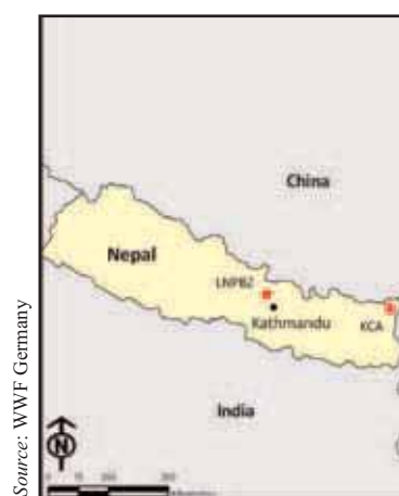
Location of the project sites in Nepal (see asterisks)