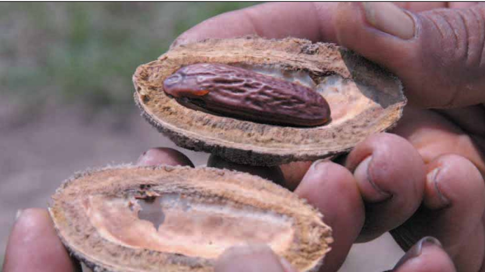
Cumaru Dipteryx odorata, Brazilian Amazon.