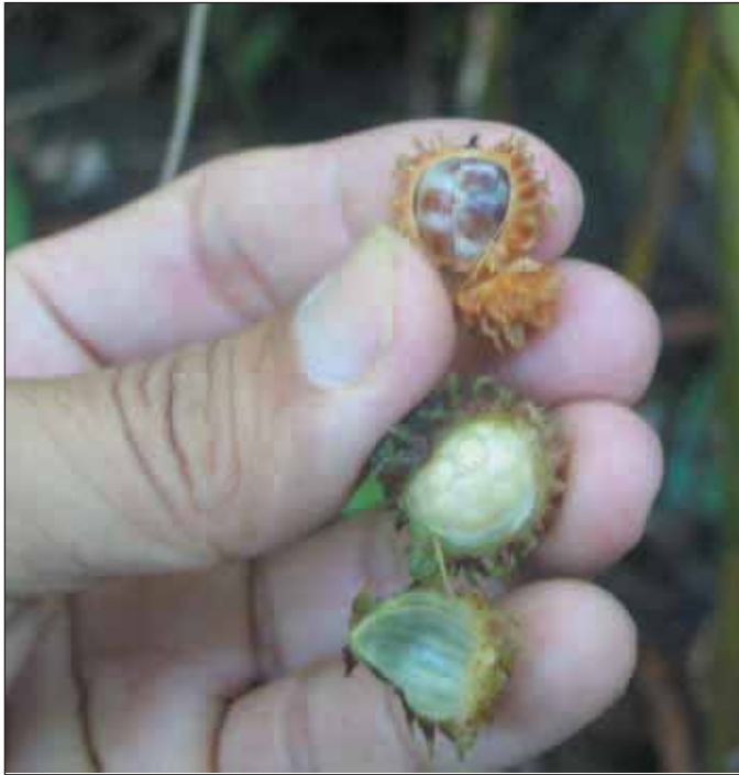
Fruit of Krakoa Amomum ovoideum , a project species in Cambodia

Training in sustainable harvest of Amomum ovoideum was carried out to ensure product quality and sustainability. It included techniques for harvesting fruits, drying techniques and methods to maintain seed quality, in part based on feedback on quality requirements from traders in Phnom Penh.