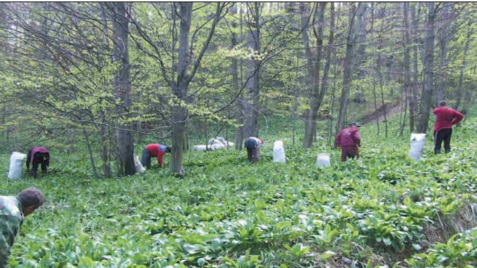
Wild Garlic Allium ursinum harvest in the project area, Bosnia and Herzegovina.