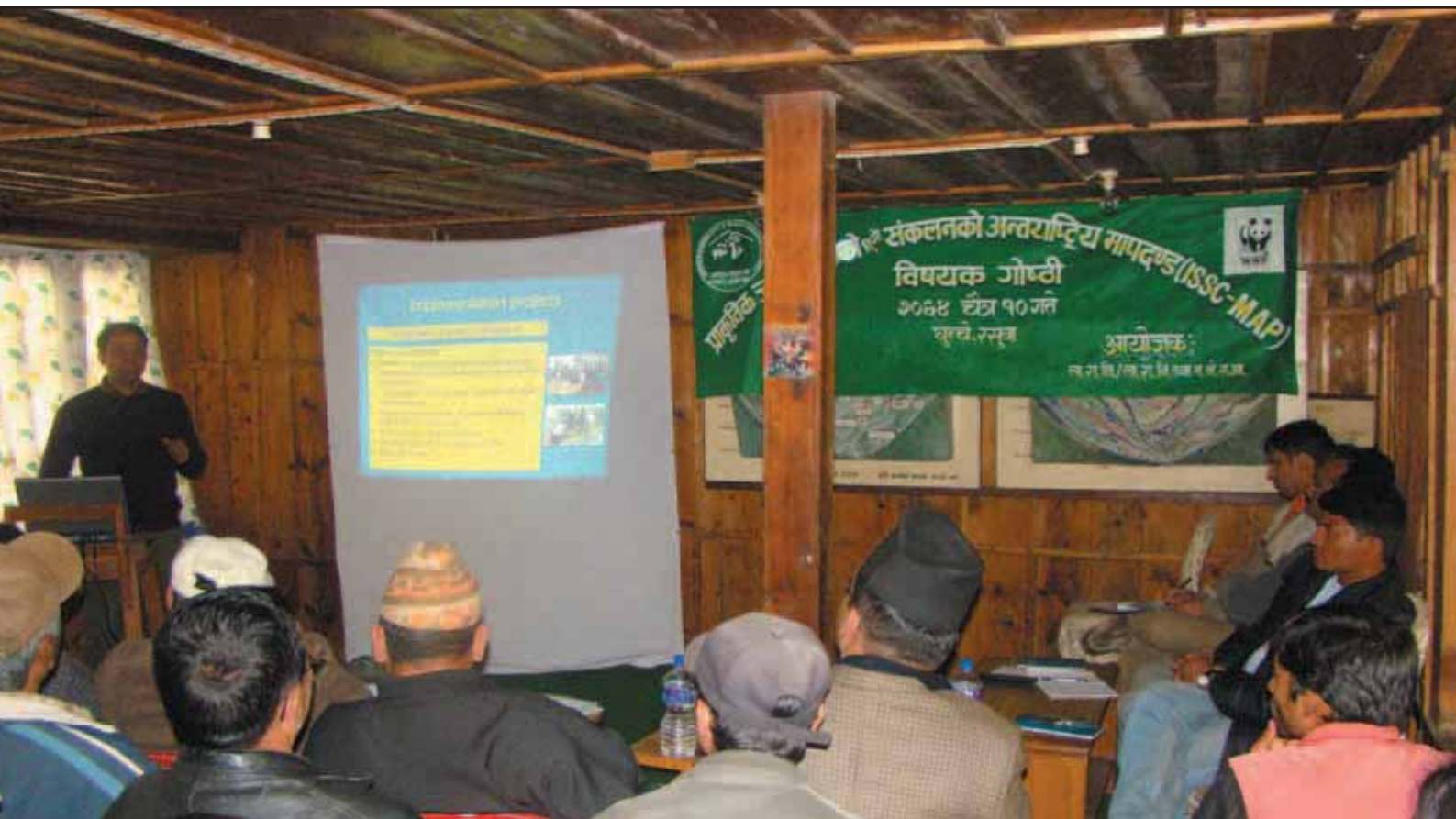
Project community meeting, Langtang National Park, Nepal.