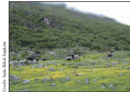
Habitat for wild medicinal and aromatic plants harvested by the project staff in Nepal

The selection of sites and species was based on a comprehensive, formal situation analysis carried out by WWF Nepal, which has been managing a number of MAP conservation projects in the country for the past two decades (Oli and Nepal, 2003), and can therefore draw on internal experts and a vast nationwide network of stakeholders in the MAP sector.