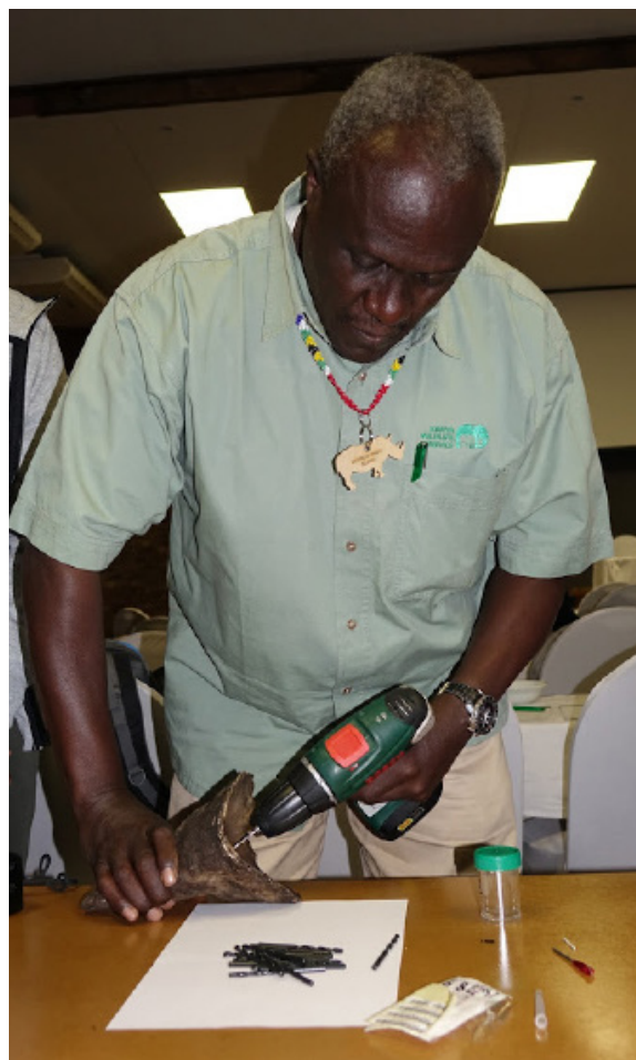
Recovering samples from rhinoceros horn for DNA extraction and analysis (©Veterinary Genetics Laboratory)

Front cover photograph and credit: White rhinoceros Ceratotherium simum adult and calf Southern Africa and East Africa. © Martin Harvey / WWF