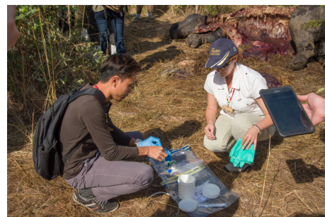
Figure 6: Ensuring chain of custody