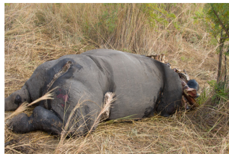
Figure 4: One of the poached rhinos