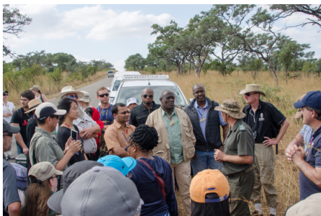
Figure 3: Poached rhinoceros briefing

The second component for this session focused on collecting suitable biological samples from the field from a poached rhinoceros carcass. Given the frequency of rhinoceros poaching in Kruger National Park (an average of just under 3 animals per day) a suitable carcass (from a double rhinoceros poaching incident) was identified and the area was secured and forensically processed in advance to give all meeting delegates access and allow them to fully experience the challenges of the field. International laboratory delegates were again given the opportunity to carry out the sampling from the rhinoceros carcass and use the eRhODIS® Forensic App developed to be used in conjunction with DNA sampling kits to ensure the continuity of the evidence from a legal perspective. eRhODIS™ was developed as an adjunct for RhODIS® to aid in the collection of samples and information relevant to the RhODIS® project and is already in use in Namibia and Kenya.