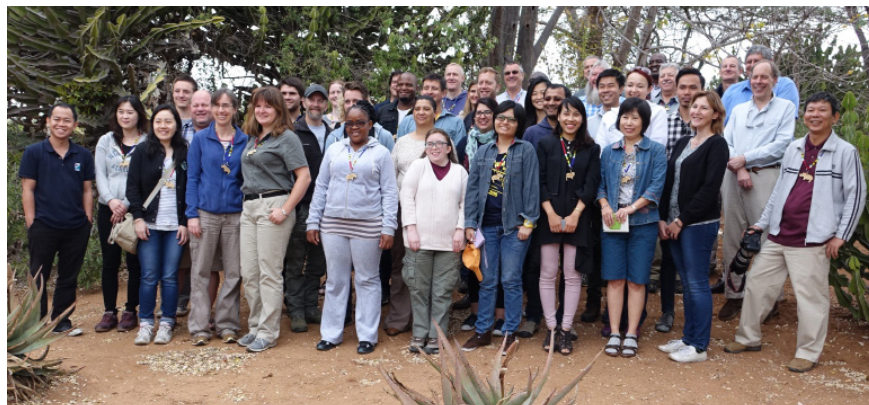
Figure 1: Meeting participant group photograph at Kruger National Park

To enable as fulsome and inclusive discussions as possible, delegates with specific enforcement or DNA technical expertise in this area were invited from rhinoceros range countries and non-range countries identified as key transit or consumer countries for rhinoceros horn. Delegates attended from South Africa, Kenya, Botswana, Namibia, India, Malaysia, Thailand, Indonesia, Viet Nam, Hong Kong, Korea, United Kingdom, Netherlands, Czech Republic and Australia, with additional representatives from TRACE, TRAFFIC, UNODC, USAID, the US Fish and Wildlife Service, and the World Bank. A full list of the participants is shown in Annex 1.