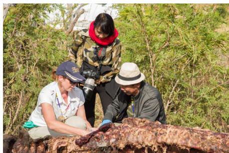
Figure 5: Tissue sample from rhinoceros carcass