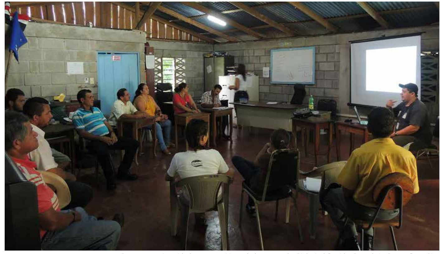
Rangers meeting with the communities to help protect the Biological Corridor Paso de La Danta, Costa Rica