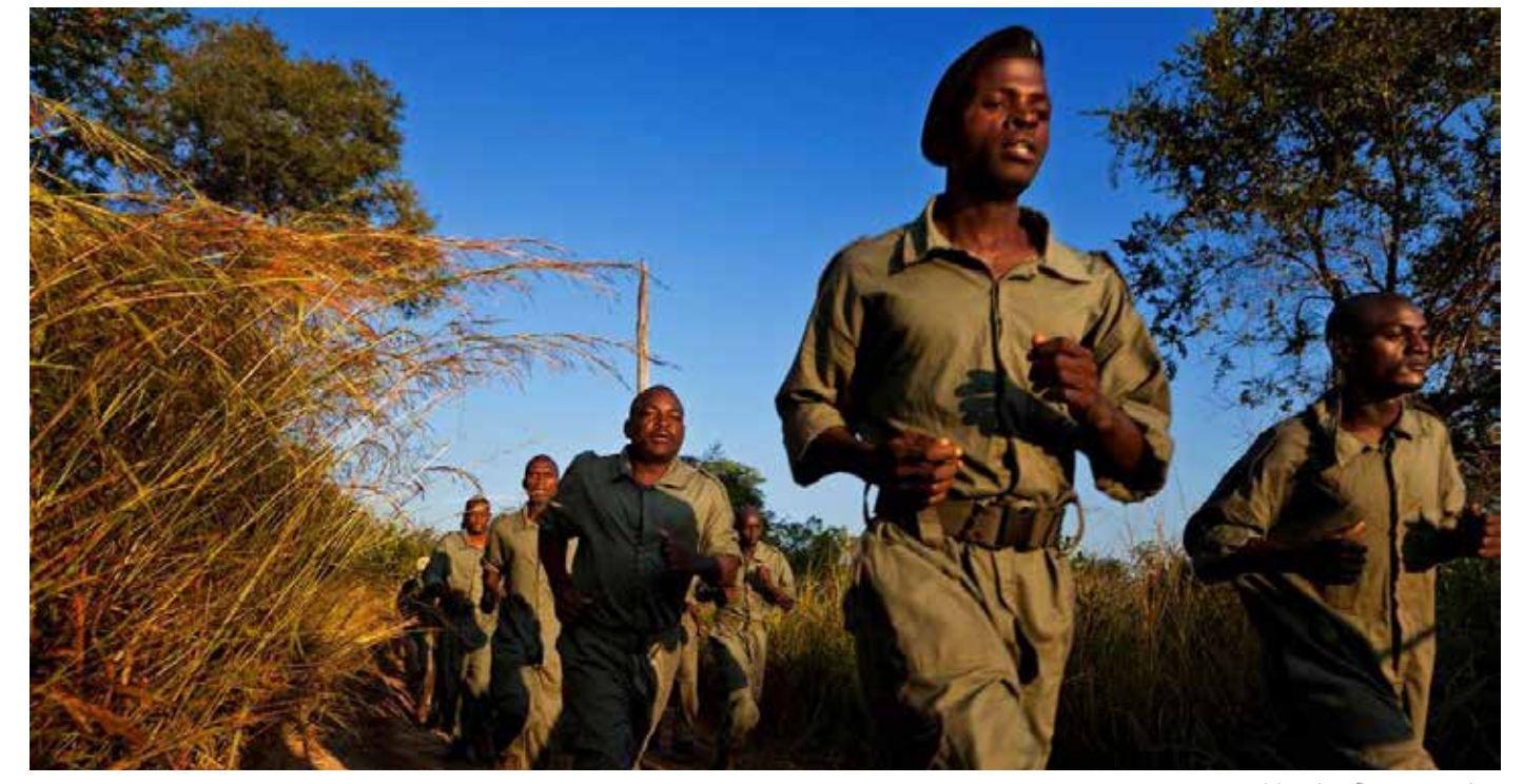
Morning fitness session