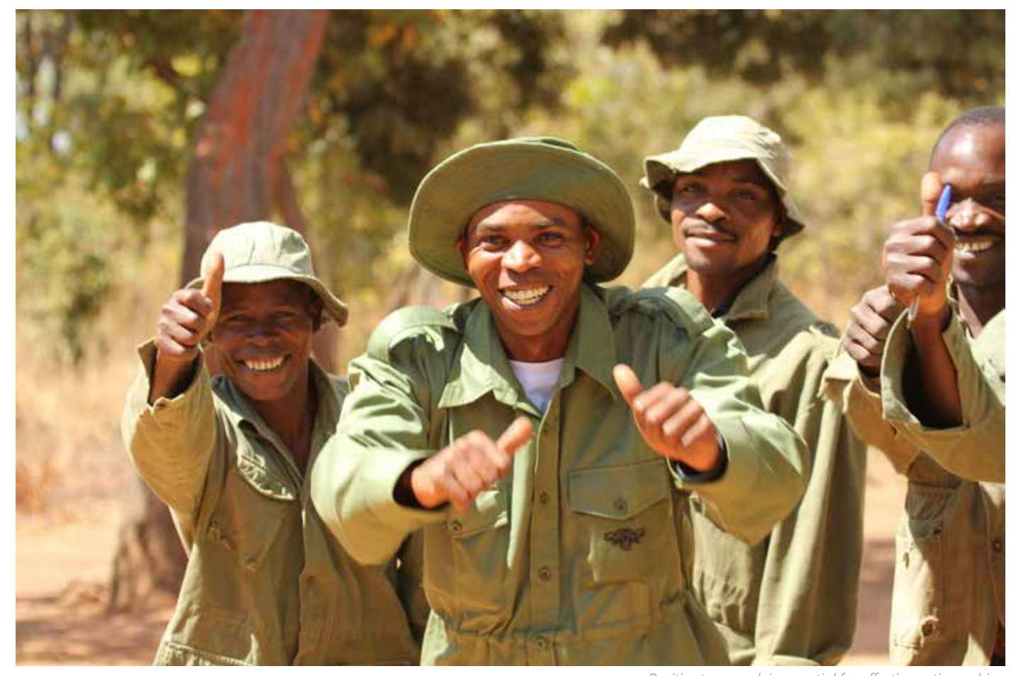
Positive teamwork is essential for effective anti-poaching

N.B. With modules including the above, where it is only covered in theory, the principles and competencies learnt should be integrated into other modules which have practical components and in which they can be reinforced and demonstrated.