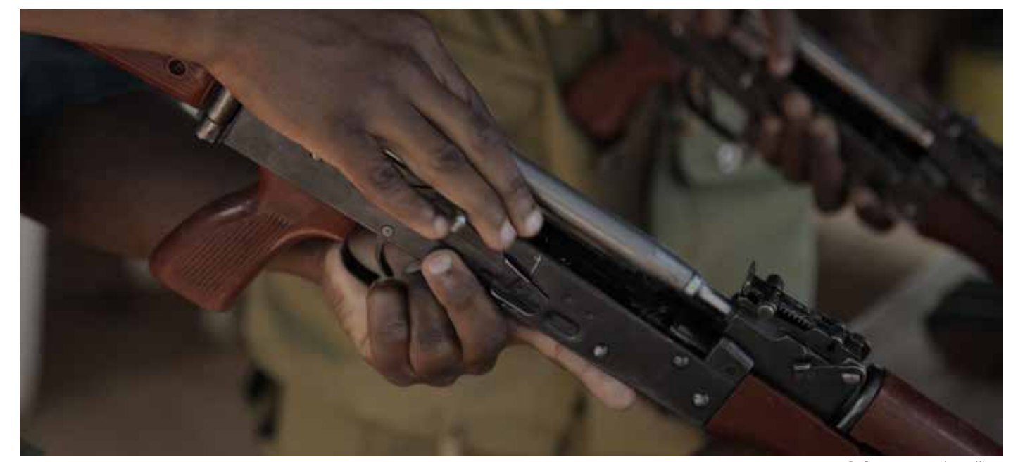
afe weapons handling

All of the above basic competencies with regard to the specific specialist firearm(s).