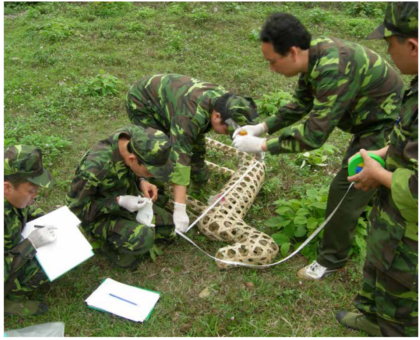
Wildlife crime scene management training