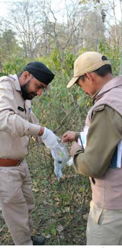
Collecting evidence for court