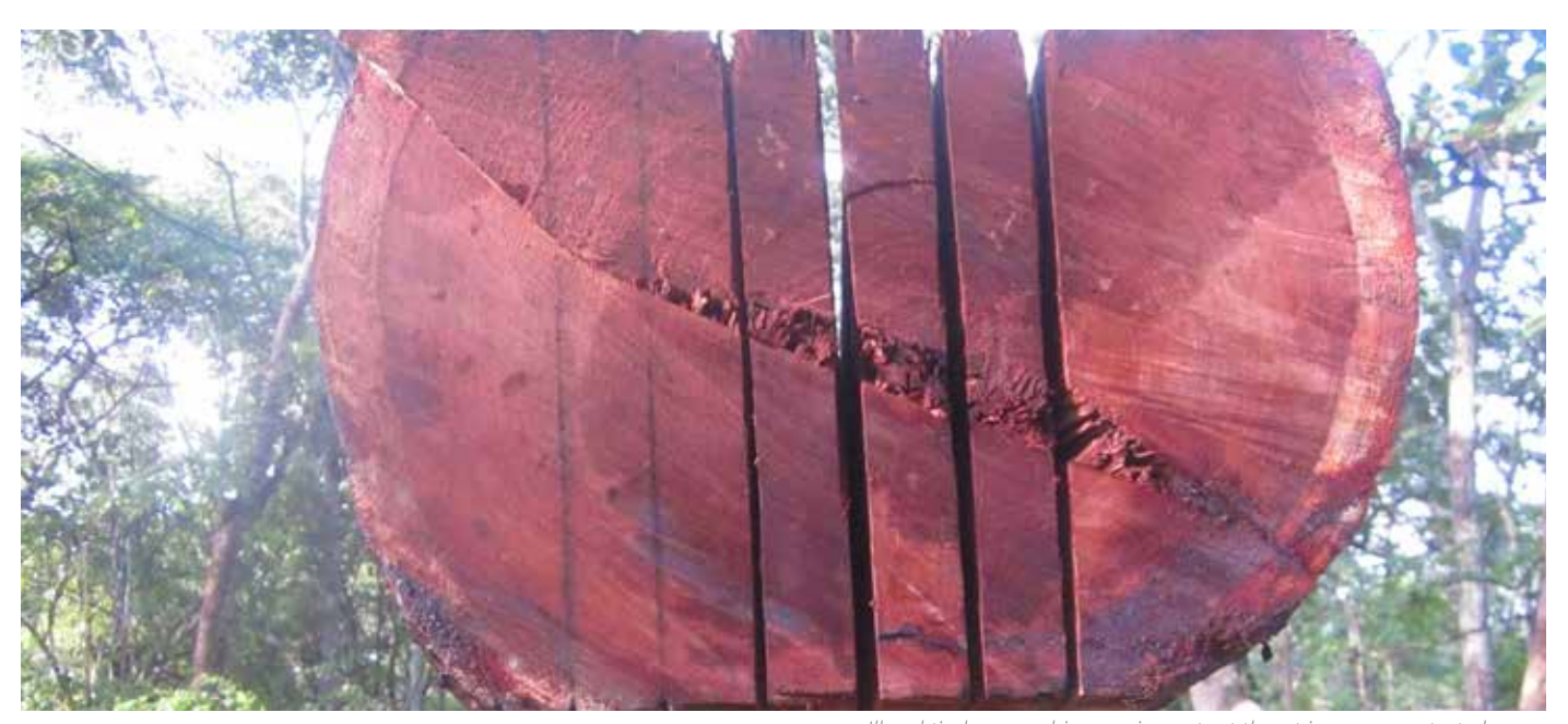
Illegal timber poaching, an important threat in many protected areas