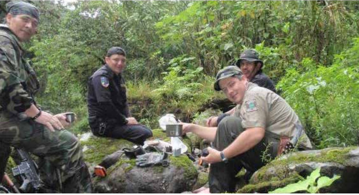
Training is essential to ensure currency and professionalism is maintained. Rangers on patrol, Costa Rica

N.B. As per above and in the preceding section 2.1 (see footnote 2), the employment of previous poachers as anti-poaching field rangers is quite common from various parts of the world including in Africa and in China. In China, apparently more than 60% of anti-poaching rangers are former poachers, and it is believed that encouraging as many of them as possible to join conservation work is an effective anti-poaching approach (Sunny Shah, WWF, pers. comm.).