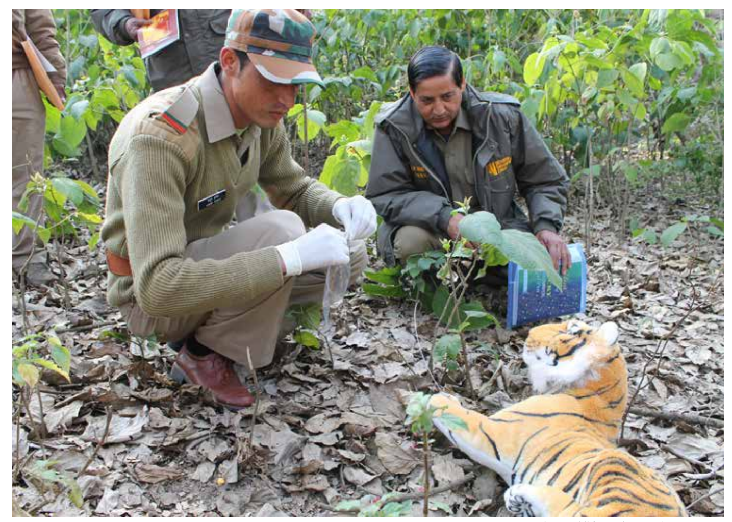
Learning about wildlife products and crime scenes