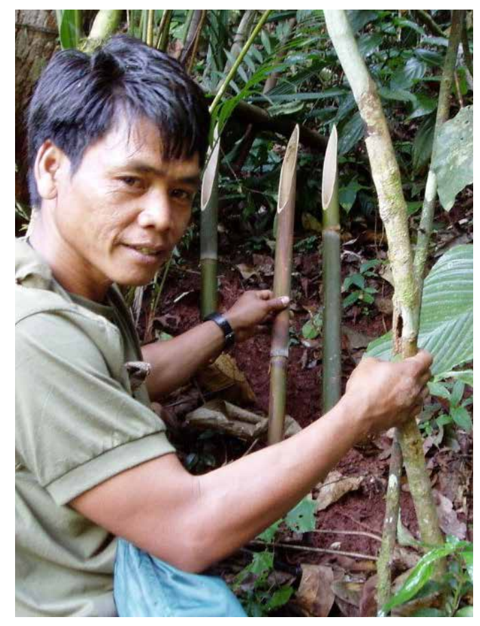
Bamboo snare