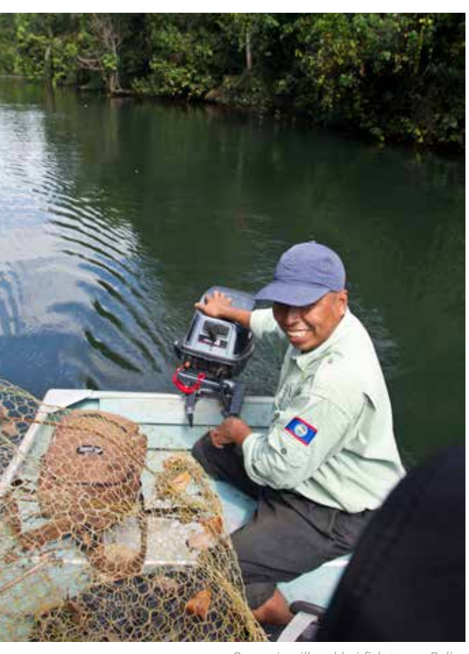
Removing illegal koi fish traps, Belize