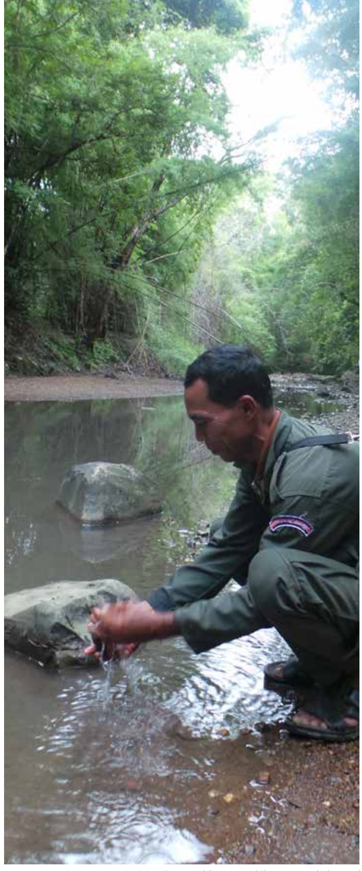
Locating potable water while on extended patrol