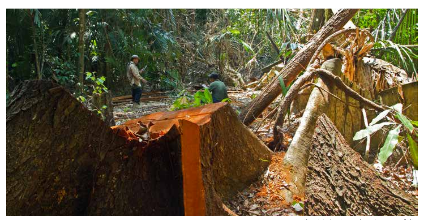
Illegal timber harvesting crime scene, Belize