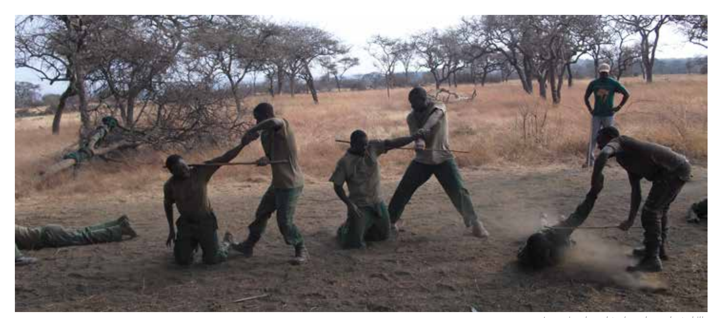
Learning hand-to-hand combat skills