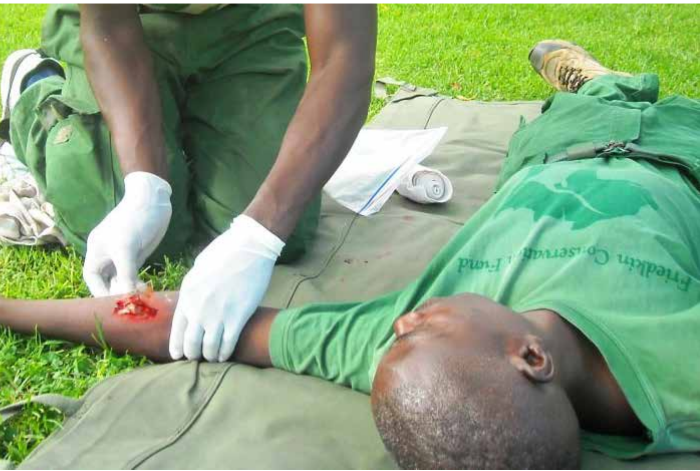
Treating a wound during first aid training