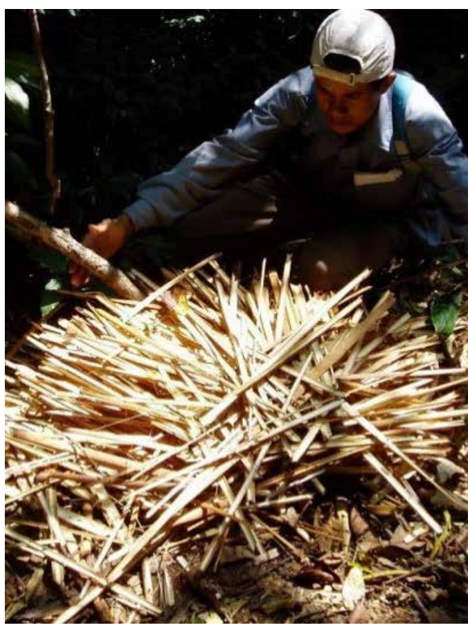
Heo pan snare