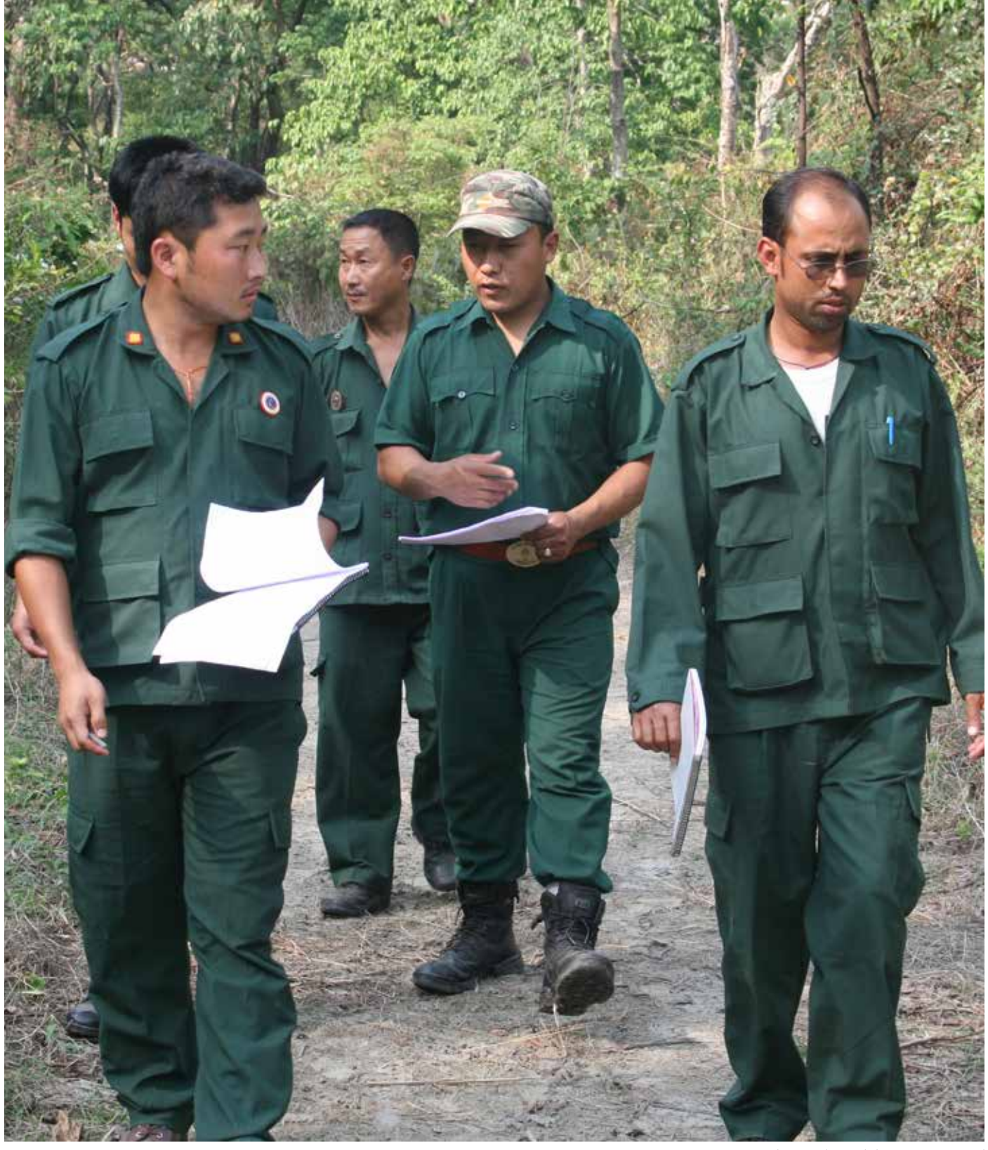
Gathering data while out on a patrol

Field ranger anti-poaching work differs, sometimes markedly, in different parts of the world and even within a country. This makes the development of useful global training guidelines challenging. These training guidelines attempt to take into consideration the various aspects across the globe. They include various elective modules that may not be required universally, but enable the unit to cater to situations where needed. The field of anti-poaching and ranger training is continually changing and improving and this document will need to be regularly updated as strategies, tactics and techniques improve.