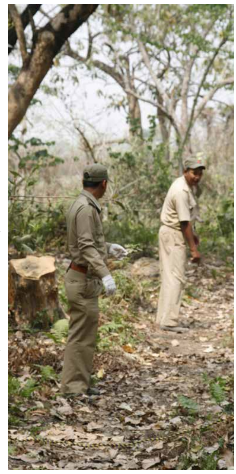
Learning about tracking and crime scene management