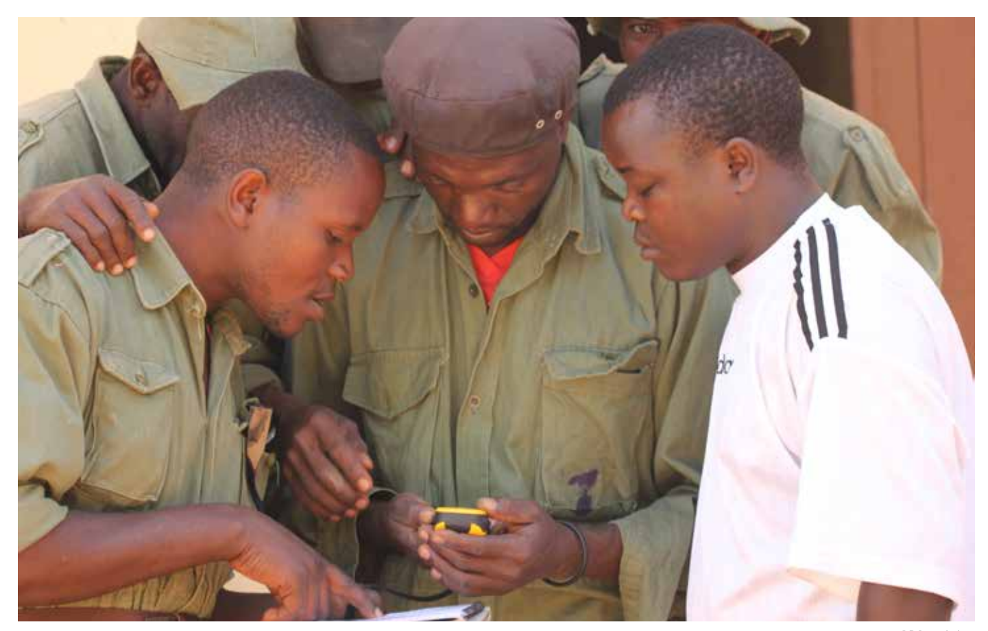
GPS training