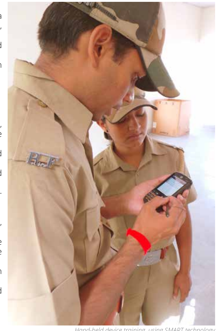
Hand-held device training, using SMART technology