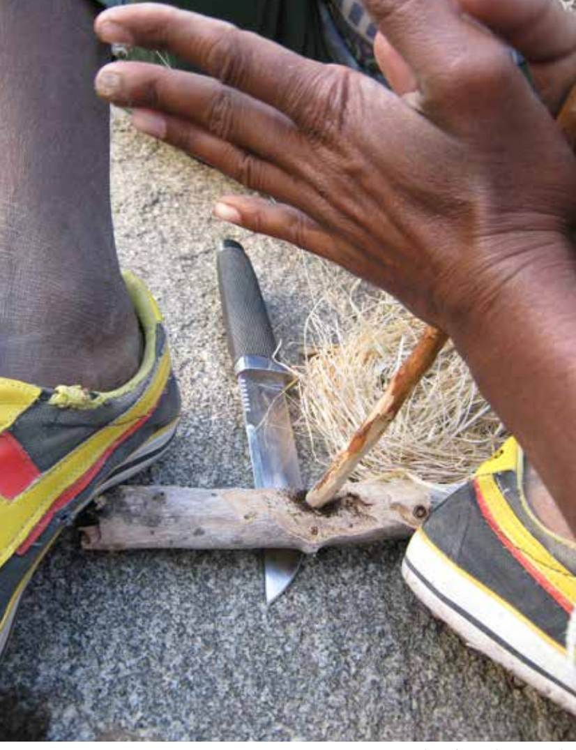
Learning to make a fire without matches © Keith Roberts