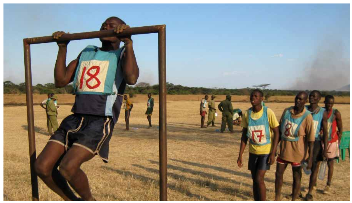
Physical stamina of rangers being assessed during Selection © Kurt Steiner

Kurt Steiner, African Parks Network, South Africa african-parks.org