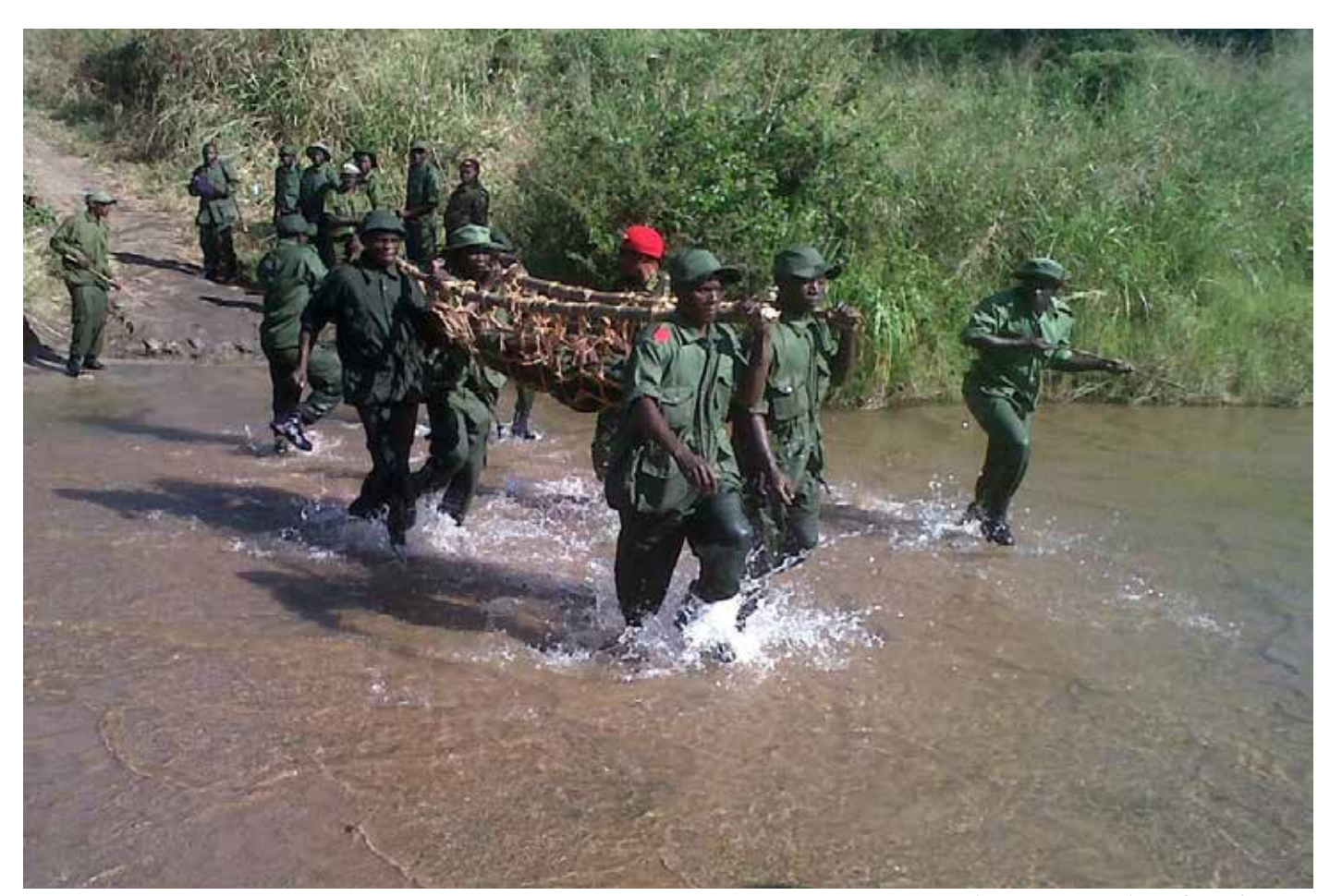
Simulating a CASEVAC during first aid training