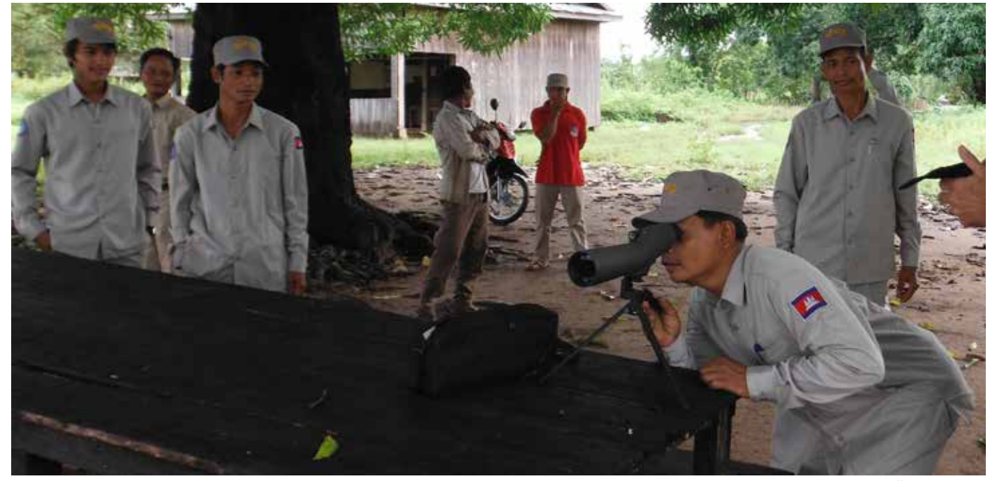
Surveillance training