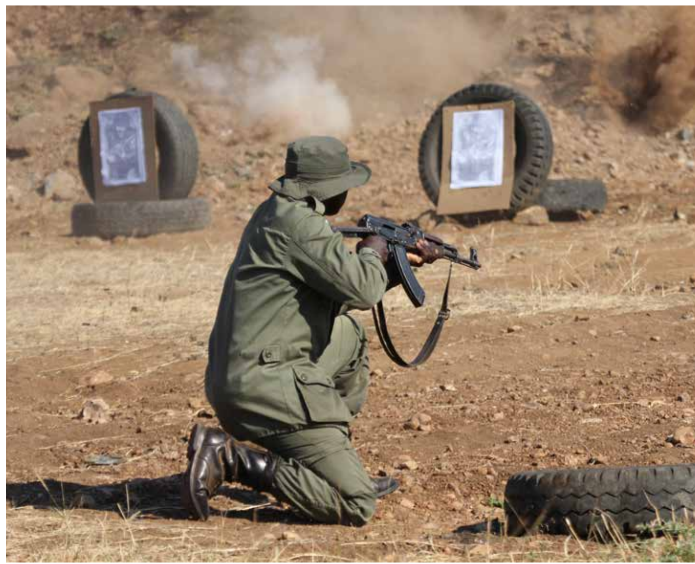
Veapons training at the shooting range

In each of the above drills, loud and clear commands and signals need to be demonstrated to call for fire, indicate targets and convey the plan of action and the operational status of each member.