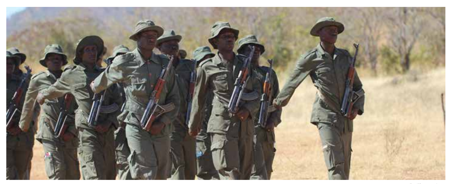
Drill session