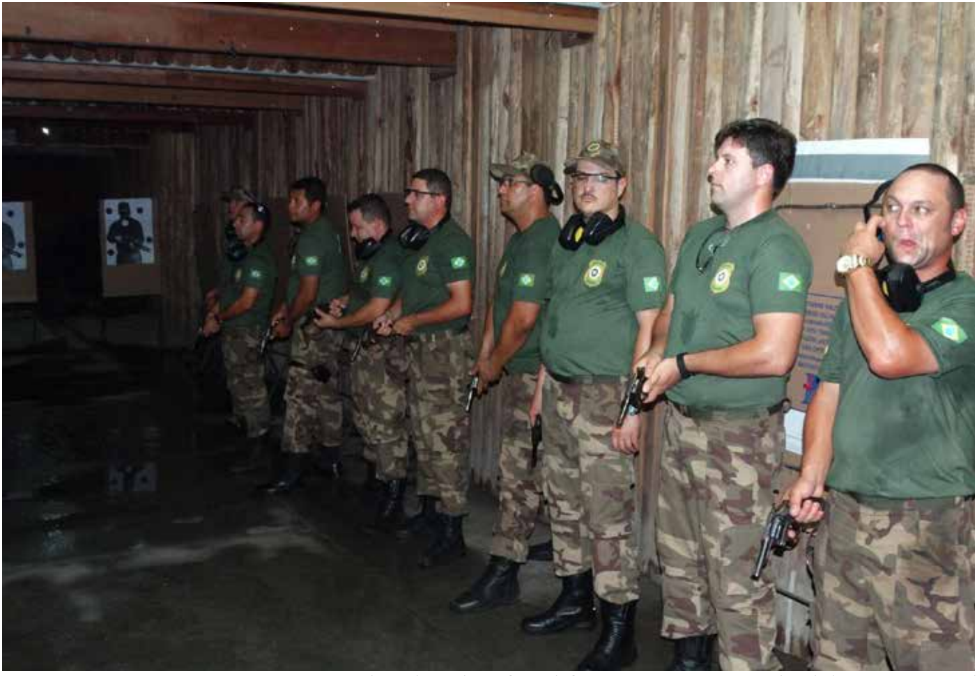
It is essential to understand 'Use of Force' before any weapons training is conducted. Shooting practice, Brazil