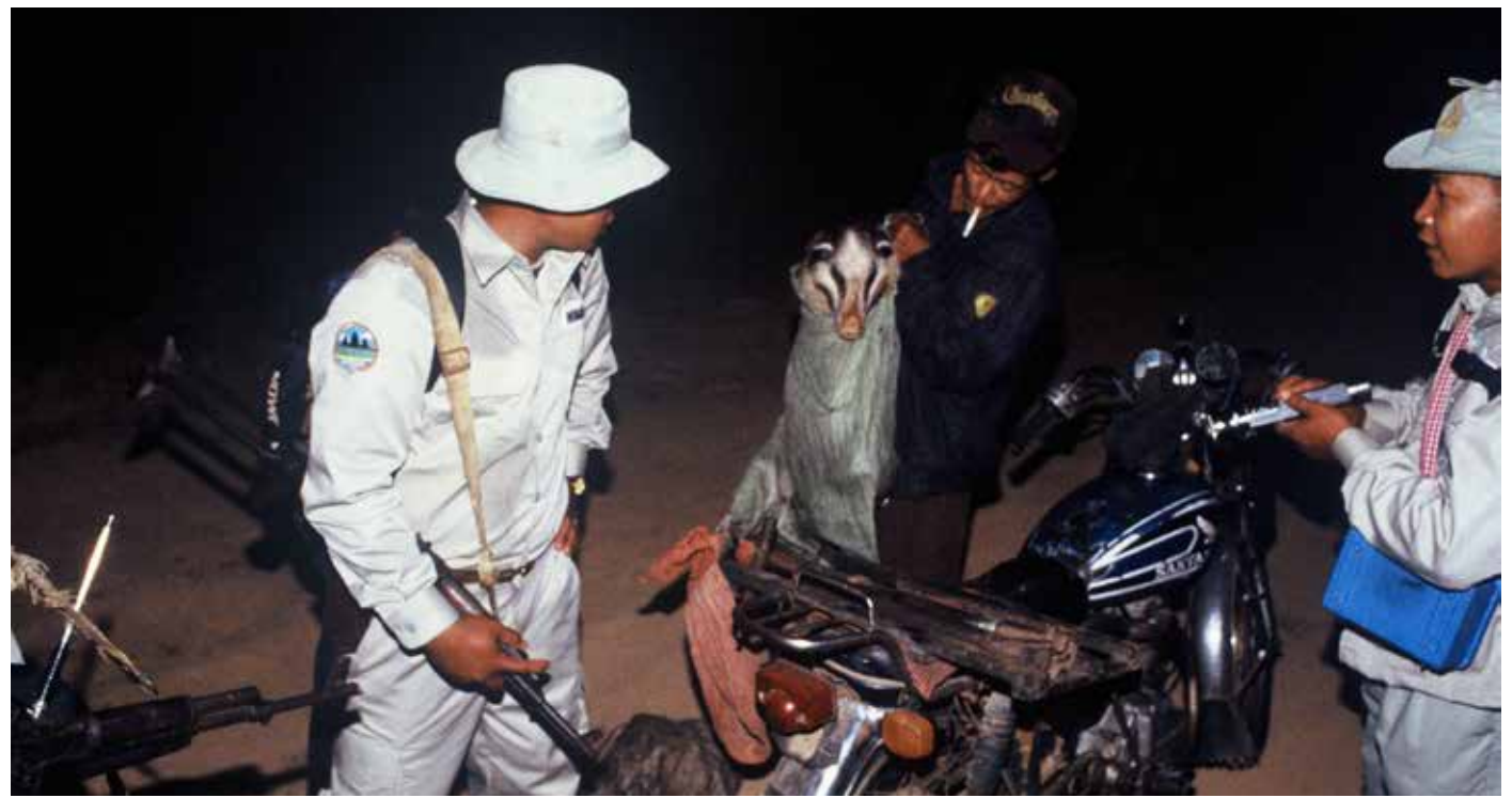
Armed forestry rangers arrest a poacher with an endangered Hog Badger during a night patrol, Bokor National Park, Cambodia