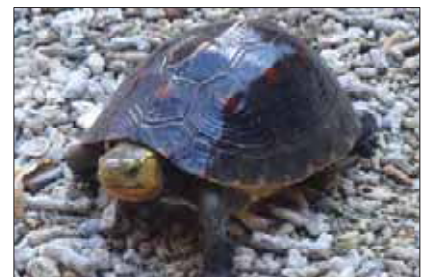
Ryukyu Black-breasted Leaf Turtle Geoemyda japonica (left) and Ryukyu Yellow-margined Box Turtle Cuora flavomarginata evelynae (right)