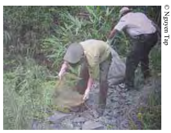
Rangers release confiscated animals back into the wild

By 1966, the government recognised that detailed guidelines were required for the exploitation, market development and conservation of medicinal flora and fauna. These guidelines were outlined in Prime Ministerial Directive 210-TTg (1966).