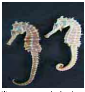
Hippocampus sp., also found on Hai Thuong Lan Ong Street