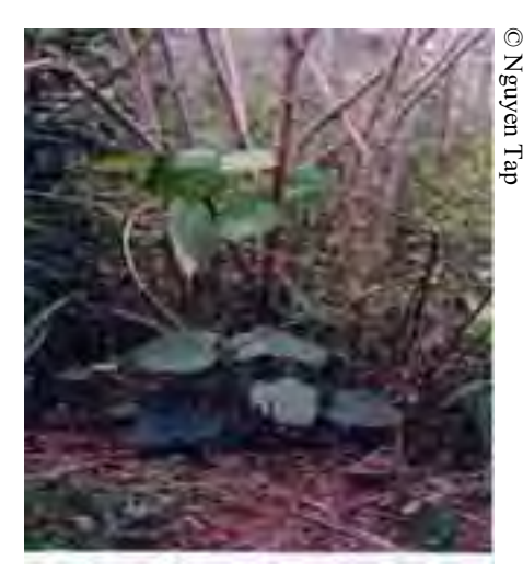
Coscinium fenestratum in Khanh Hoa province