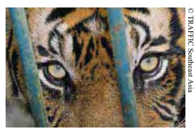
Caged tiger Panthera tigris

In traditional medicine, many different parts of the tiger have been used to produce remedies for a wide range of complaints. A number of tiger parts are used for their reported ability to treat arthritis. Tiger bones are boiled in water to produce a 'bone gel', which is believed to