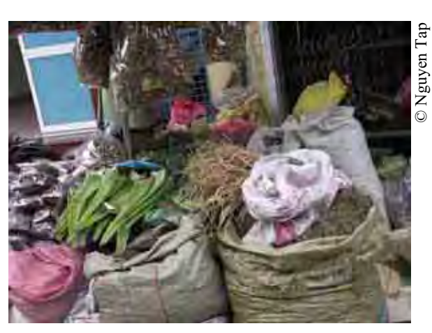
Traditional medicine on sale in HCMC

This study was conducted from 1st to the 10th of August, 2006. The surveys were conducted by two teams made up of Vietnamese nationals. Team members included pharmacists and ecologists. Pharmacists were employees of the Institute of Materia Medica, the Ginseng and Medicinal Materials Research Centre and a number of private and state-owned pharmaceutical companies based in either Ho Chi Minh City or Da Nang City. Ecologists were from the Da Nang Forest Protection Department, the Viet Nam-Russian Tropical Centre in Ho Chi Minh City, the National University of Ho Chi Minh City and the TRAFFIC Southeast Asia Programme.