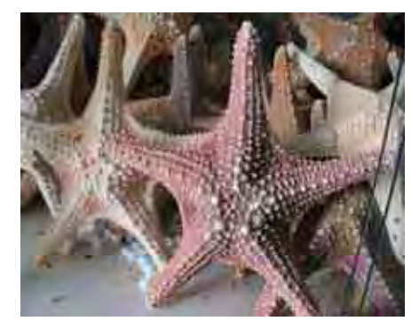
Starfish sold in shops