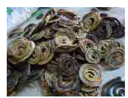
Dried snakes from Mekong Delta sold in medicine shops on Lan Ong street