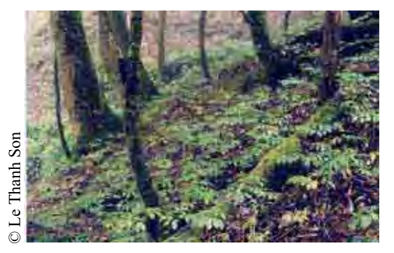
Vietnamese ginseng in Quang Nam province

A number of these (32 species) have not yet been successfully cultivated in Viet Nam. In order to supply the market demand they are imported in large quantities of up to 100t per annum. Ziziphus sativa and Glycyrrhiza glabra are examples of these plants.