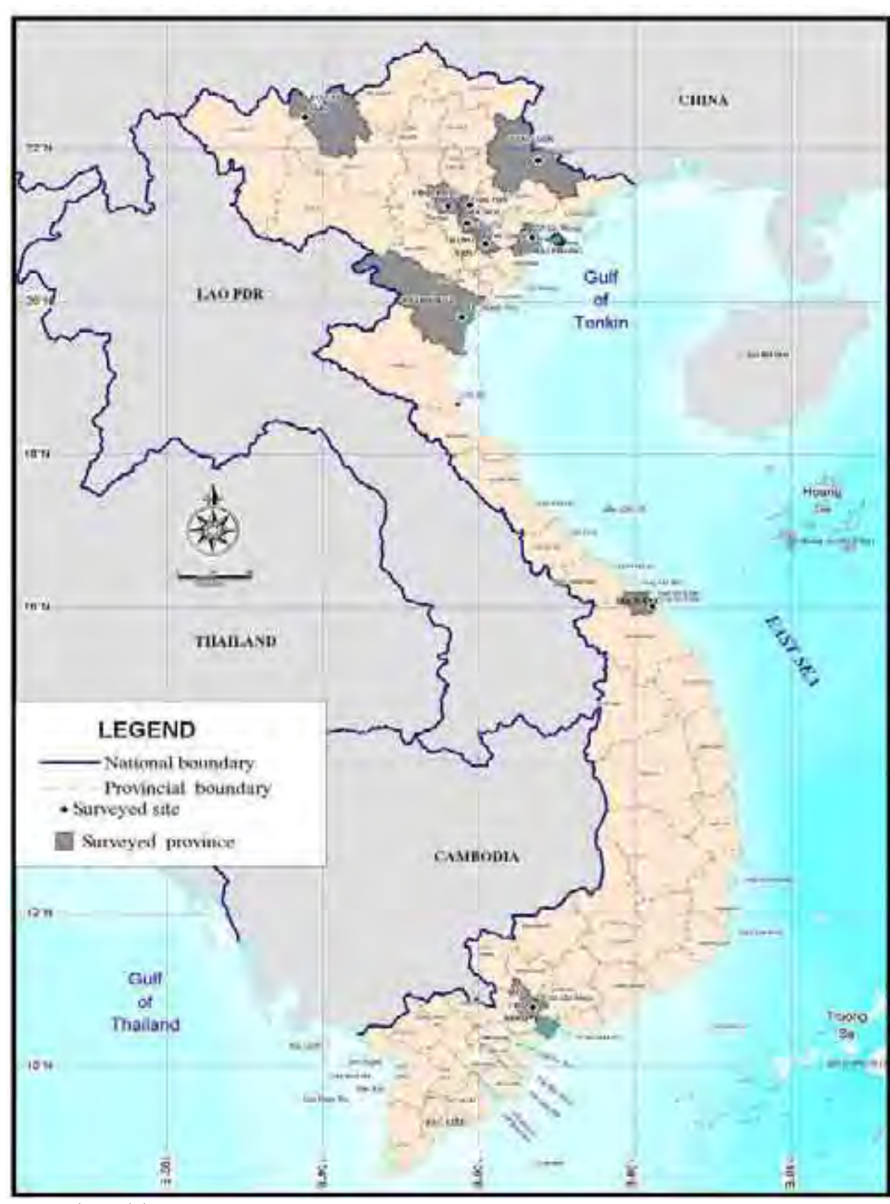
Figure 1 Locations surveyed for traditional medicine in Viet Nam