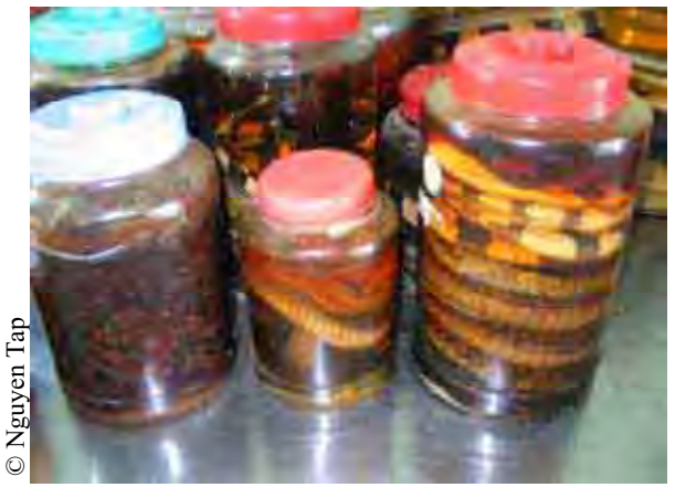
Animal wine at specialty restaurant

Hai Phong, situated on the southern bank of the Red River as it reaches the coast, is the third most populous city in Viet Nam. It is one of the main industrial centres of the North of Viet Nam, and is one of the country's most important seaports. Hai Phong is regarded as a major centre for the trade in wild animals in Viet Nam (Anon., 2004a). Animal-based TM products are publicly displayed for sale across the city. During the survey, 22 types of oriental medicine were openly on sale (Table 4). Various whole animals (e.g. seahorses, snakes, geckoes and coucals) and their parts (e.g. bear paws) were usually sold steeped in alcohol. There are five large oriental medicine shops and two shops offering wild animals steeped in alcohol. Traditional medicines are also available in chemists, liquor shops and restaurants in Hai Phong.