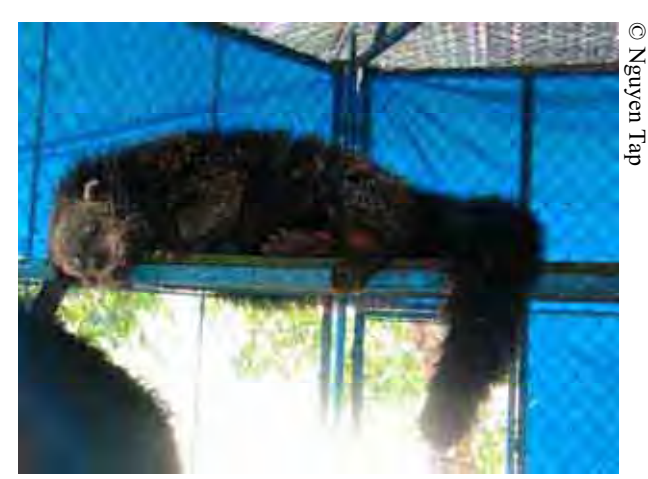
Arctictis binturong ranched in HCMC

As wild populations of animals used in traditional medicines decline in Viet Nam, imports from other Southeast Asian nations including Lao PDR, Cambodia, Myanmar and Indonesia have become an increasingly important source (Do Kim Chung et al. , 2003). During this survey, one species of invertebrate, the Earthworm, was reportedly imported from China. As is the case with medicinal flora, some animals traded and used in traditional medicine have multiple sources – they may be hunted from the wild, bred in captivity, or imported (legally or illegally) from neighbouring countries.