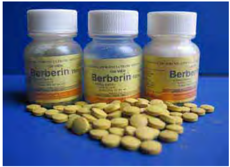
Berberin tablets made from Coscinium fenestratum