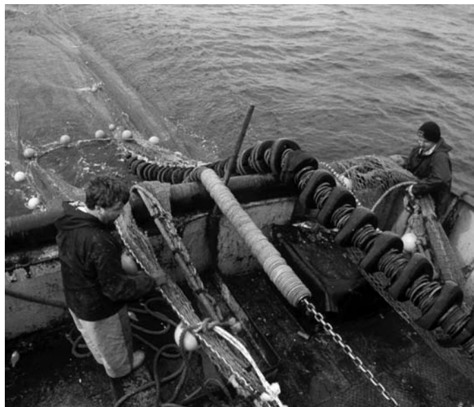
Shooting away the trawl on a North Sea trawler.

Attempts to improve the performance of RFMOs require the causal factors of poor performance to be clearly identified. Although each individual RFMO operates in a relatively unique geo-political environment there is nevertheless a strong degree of commonality in the factors affecting their performance. IUU fishing by highly mobile fleets under the control of multinational companies is widely recognized as a major threat to the sustainability of the world's living marine resources as well as the broader marine environment in which fishing activity takes place and much work has been done in attempting to identify ways in which IUU fishing can be prevented, deterred and eliminated.