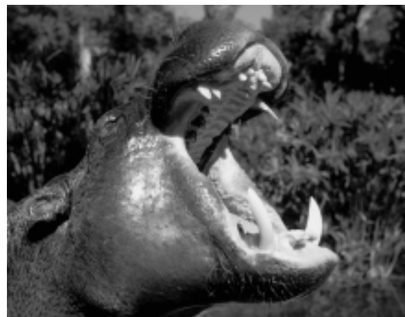
Upper and lower canines and incisors are the most common sources for hippo ivory, which may be used in carvings, scrimshaw, and knife handles.

In 1999, the CITES Animals Committee initiated a Significant Trade Review for the species, to determine the potential impacts of trade and other activities on hippo populations in Africa. That report found that, among the primary countries of origin for hippo ivory entering the world market—and by implication the US market—hippo populations were considered stable in South Africa, Tanzania and Zimbabwe, and increasing in Zambia. The only country that has appears regularly in recent hippo ivory trade data for which the