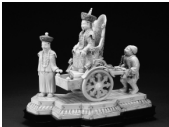
Ivory carving is one of China's most ancient arts, with examples of skillfully carved ivory dating as far back as the Shang dynasty (18th–12th century BC).