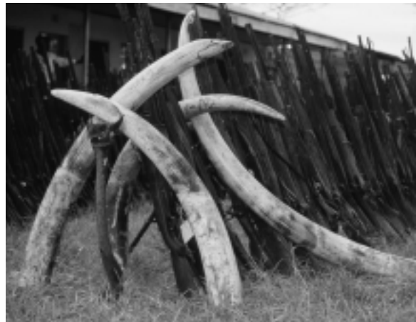
Confiscated ivory and muzzle-loaders on display in front of the Luangwa Wildlife Office near South Luangwa National Park, Zambia.

CITES established a worldwide system of controls on international trade in threatened and endangered wildlife and wildlife products. At present, some 5000 species of animals and 28 000 species of plants are covered by the Convention. Protection for species is provided under the Convention's three Appendices, which describe the status of the species and determine what species may enter international commercial trade. The most endangered species are listed in Appendix I, which includes all species threatened with extinction that are or may be affected by trade.