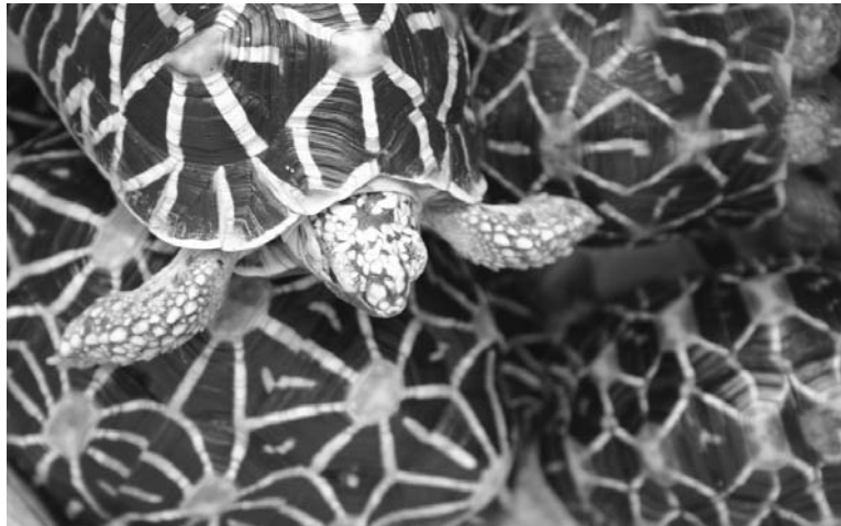
Indian Star Tortoise, Geochelone elegans