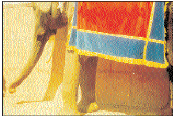
Elephant in Jaipur with one tusk missing

Karnataka was reported to have 80 elephants, including 27 tuskers, with the State forest department. In Karnataka, a ban has been imposed on the allocation of forest department elephants to private parties, individuals and institutions, religious or otherwise. Also there is a ban on the use of elephants for functions and processions. These two orders have effectively discouraged the private ownership of elephants in the State and there appear to be very few elephants with private owners. In Bangalore city, no elephants were reported to be with private owners nor with any religious institution. In Mysore city, privately owned elephants were found at only two places (apart from zoos), namely, at the Maharaja's palace, where two females were kept, and at Sri Suttur Mutt, a religious institution, where one young male was kept. Elephants were also kept at Bannerghatta and Mysore zoos. At Bannerghatta Zoo there were five elephants (two tuskers, two adult females and one juvenile female). The animals were young and the tusks were found to be intact. At Mysore Zoo there were 10 animals, (seven Asian Elephants and three African Elephants). Among the Asian animals there were two females, two young females, two old tuskers and one young tusker. Among the African Elephants there was one tusker, one female and one young male. Here, also, the animals were well kept and the tusks intact, although heavily shaped.