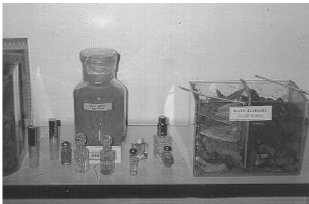
Agarwood perfume, chips and powder in Malaysia, 1999

The use of agarwood for perfumery extends back several thousands of years, and is referenced, for example, in the Old Testament several times using the term 'aloes'. Both agarwood smoke and oil are customarily used as perfume in the Middle East (Chakrabarty et al. , 1994). In India, various grades of agarwood are distilled separately before blending to produce a final 'attar'. Minyak attar is a water-based perfume containing agarwood oil, which is traditionally used by Muslims to lace prayer clothes (Yaacob, 1999).