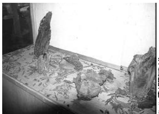
Agarwood on display in a shop in Di Hua Street, Taipei, in 1998

It appears that Taiwan has also acted as a re-exporter of Aquilaria malaccensis , as 1996 CITES annual report data for Singapore show the import of approximately four tonnes of chips from Taiwan, this agarwood reported as originating in Indonesia.