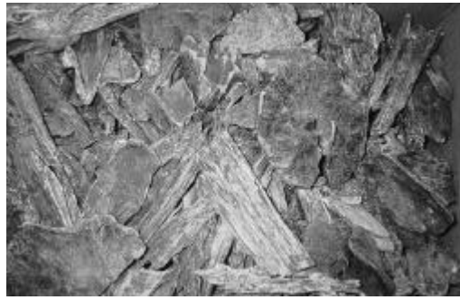
Agarwood chips photographed in Taiwan, January 1999