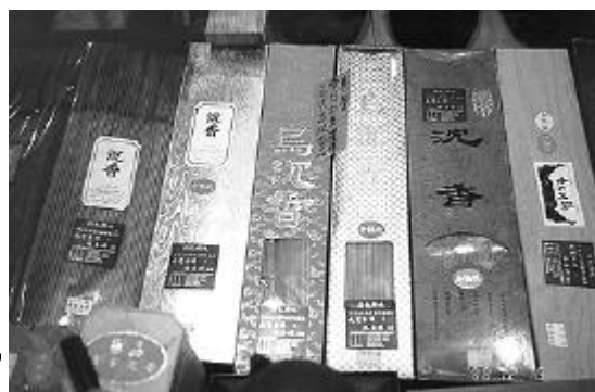
Agarwood incense sticks on display in Taiwan, 1998