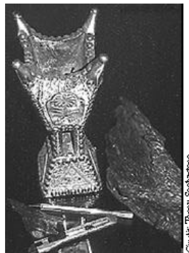
Agarwood incense burner with a piece of Aquilaria wood alongside

Although it may be possible to use healthy Aquilaria wood to make simple ornamental boxes, this wood is typically too light and fibrous (rather like balsa wood) to be suitable for furniture, construction or even carving. Some foresters in India have suggested using Aquilaria wood for constructing tea-boxes (Chakrabarty et al. , 1994). Aquilaria bark was reportedly used for this purpose during the nineteenth century (Heuveling van Beek and Phillips, 1999). There is a considerable number of craft shops offering religious 'agarwood' sculptures, usually Bhuddhist figures. Although a proportion of immature agarwood is used in this trade, most statues are not made with agarwood, owing to its soft and flaky properties, which make it unsuitable for carving. Instead, tropical hardwoods are treated to resemble agarwood. The wood