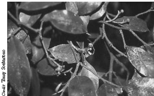
Leaves of Aquilaria malaccensis tree

Aquilaria malaccensis is one of 15 tree species in the Indomalayan genus Aquilaria , family Thymelaeaceae, (Mabberley, 1997). It is a large evergreen tree growing over 15-30 m tall and 1.5-2.5 m in diameter, and has white flowers (Chakrabarty et al. , 1994). A. malaccensis and other species in the genus Aquilaria sometimes produce resin-impregnated heartwood that is fragrant and highly valuable. There are many names for this resinous wood, including agar, agarwood, aloeswood, eaglewood, gaharu and kalamabak ,