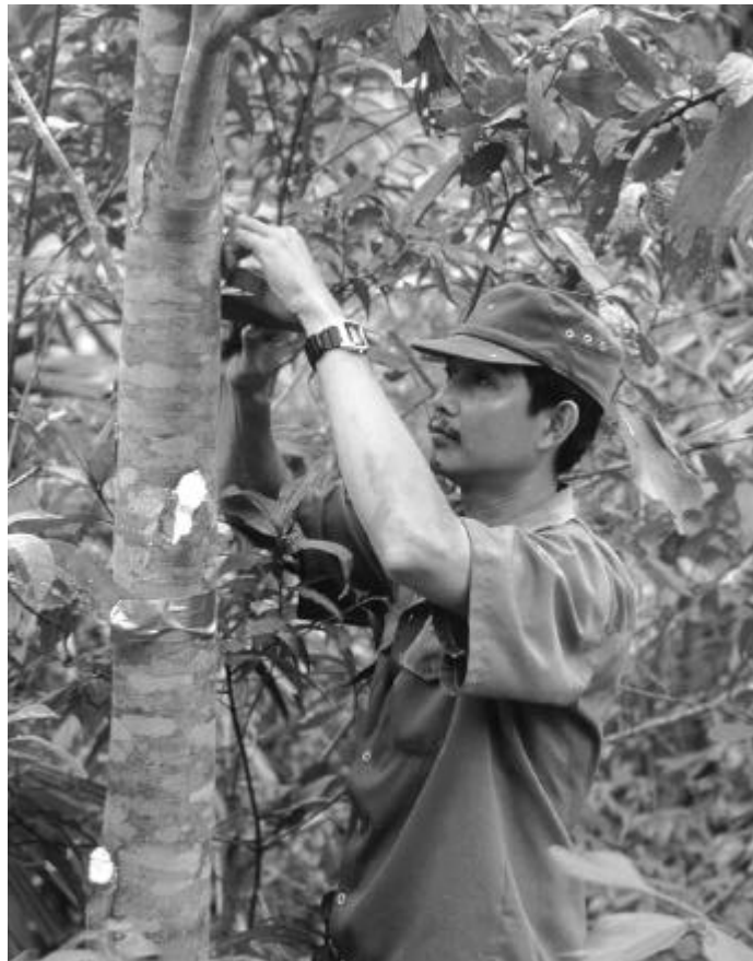
Forester in Vietnam experimenting with agarwood formation in Aquilaria spp.