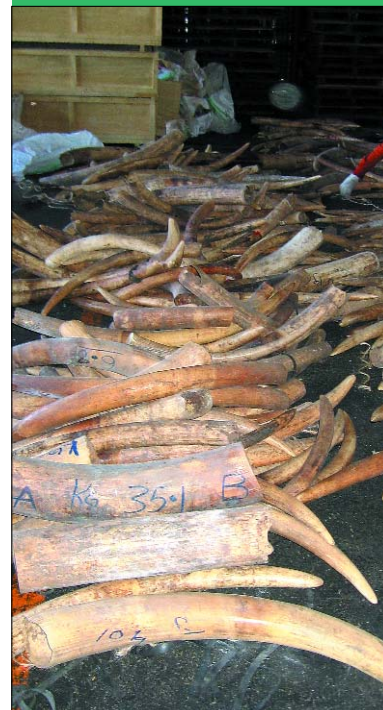
Part of an illegal consignment of 2.5 tonnes of ivory seized by Taiwanese authorities in July 2006 at Kaohsiung harbour. The ivory was en route from Tanzania to the Philippines. Two days later, a further 3 tonnes were seized at the same port.

Under Decision 13.26 , African Elephant range States are charged with demonstrating compliance with the requirements of Resolution Conf. 10.10 (Rev. CoP14) for internal trade in ivory. Legislation and law enforcement action to enforce such legislation is assessed. Countries which allow ivory markets to remain poorly regulated can be penalized with punitive sanctions under the Convention, including the suspension of all trade in CITES-listed specimens. Seventeen of the 37 African Elephant range States (Benin, Burkina Faso, Central African Republic, Chad, Congo, Equatorial Guinea, Eritrea,